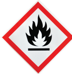
Warning Labels Supplied