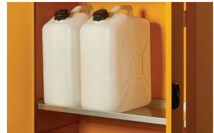
Adjustable Spill Retaining Galvanised Shelf