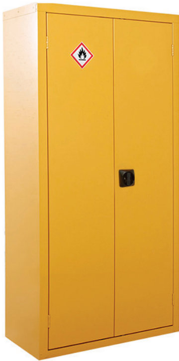
TUFF COSHH Cupboard H1800 x W900 x D460mm