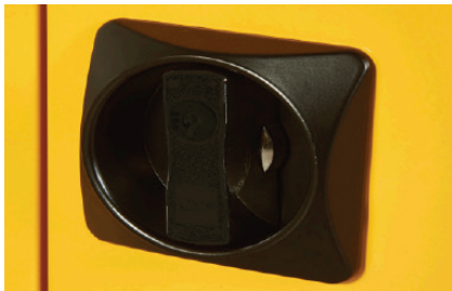
2 Point Locking System - Supplied with Keys