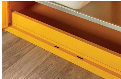
14 Litre Sump Capacity